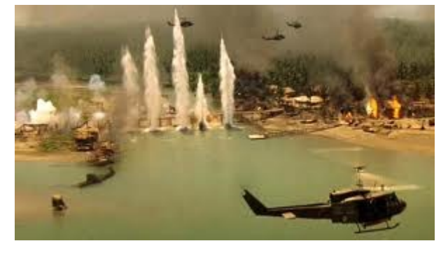
2 extreme long shot