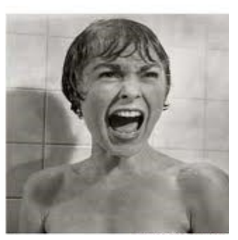
6 close shot